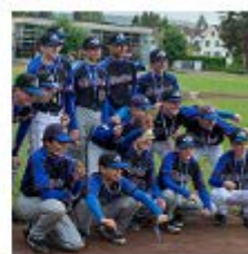
6th Int Tournament