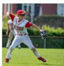
6th Int Tournament