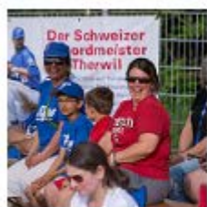
6th Int Tournament

contact: sebastian.zwyer@therwil-flyers.ch / turnier@therwil-flyers.ch