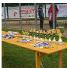
6th Int Tournament